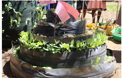
Figure 7: Tyre gardens are an efficient way to maximize land and undertake kitchen horticulture