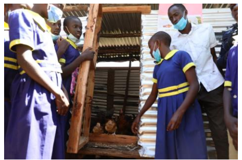
Figure 5: Young people tending chicken at the Youth Centre