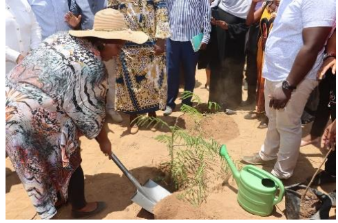
Figure 3: UNDP Deputy Resident Representative – Programme planting a tree to commemorate the launch of