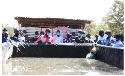
Figure 6: Fish farming in over the ground fish ponds