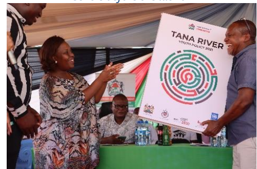
Figure 2: Handing over of the Tana River Youth Policy