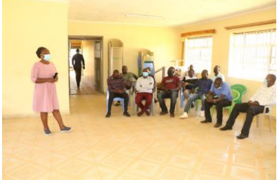
Figure 8: A session with young people at Butula Youth Centre, Busia County

Consolidating Gains and Strengthening Devolution in Kenya United Nations Development Programme — Regional Bureau for Africa January — June 2022 Semi-Annual Progress Report