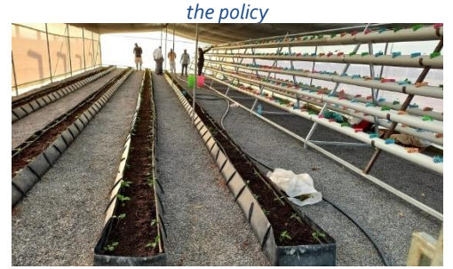
Figure 4: Hydroponic Firm at the Youth Centre